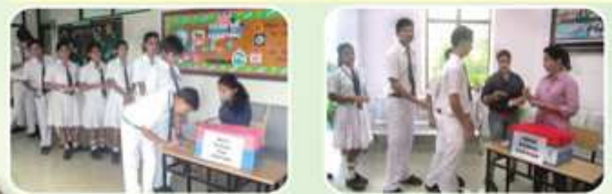
Glimpses of free and fair Student Council Elections