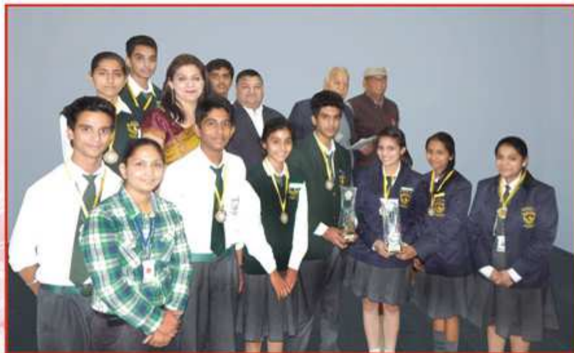
DPS HRIT campus bagged the First position in both under 17 and under 15 categories of National Children Science Congress District Level 2014.

God may grant all our students continued success to enhance their education.